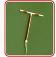
Agapira ko mumura